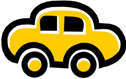
steel car left